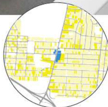
Residential Land Use