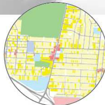
Full Land Use