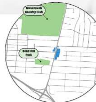
Parks and Open Spaces