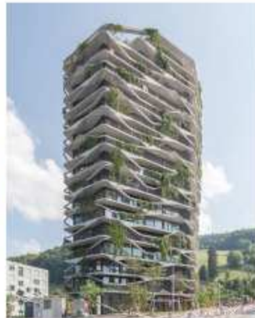
Facade Style Reference