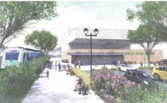
Whole Foods Entrance Rendering